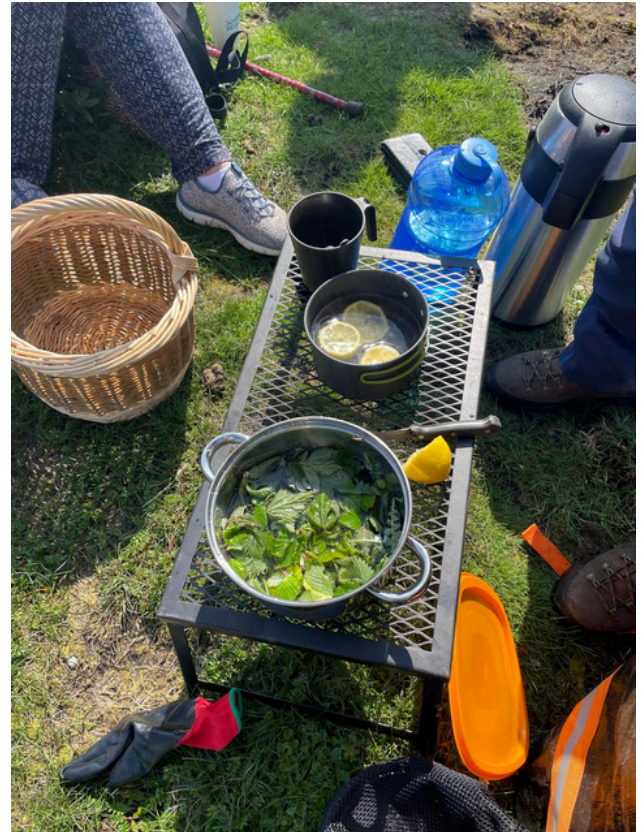
Tea making

We also ran our medicinal plants and tea making walk. We took a gentle ramble down the Druimyeon Bay Link path taking a closer look at some easily identifiable plants and chatting about their medicinal properties throughout time and nowadays. We then made some tea infusions at Druimyeon Bay using nettles, silverweed, sorrel, hawthorn and bramble leaves. We had such beautiful weather for the walk – thank you to everyone who came along, it was fabulous!